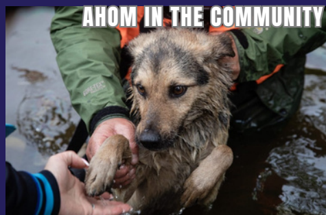
AHOM IN THE COMMUNITY